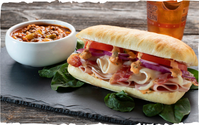
SOUP* + SANDWICH