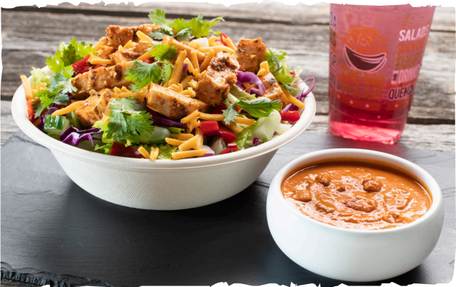
SALAD + SOUP*