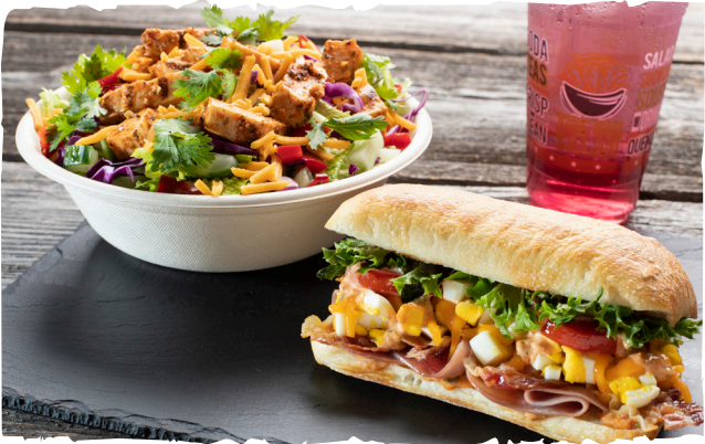
SALAD + SANDWICH

PREMIUM SALADS, SANDWICHES, AND SOUPS MAY RESULT IN AN ADDITIONAL CHARGE.